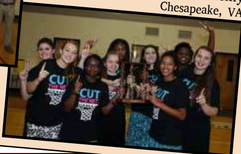
Girls Winners Great Bridge Christian Academy Chesapeake, VA

Hilltop Christian School Fuquay-Varina, NC