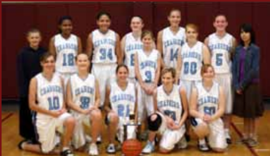
Hilltop Christian School 2010 Varsity Girls Basketball Champions