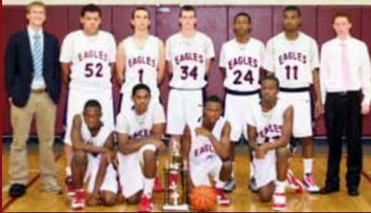
Raleigh Christian Academy 2010 Varsity Boys Basketball Champions