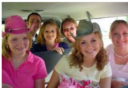
In Colorado Springs with the Guin girls.