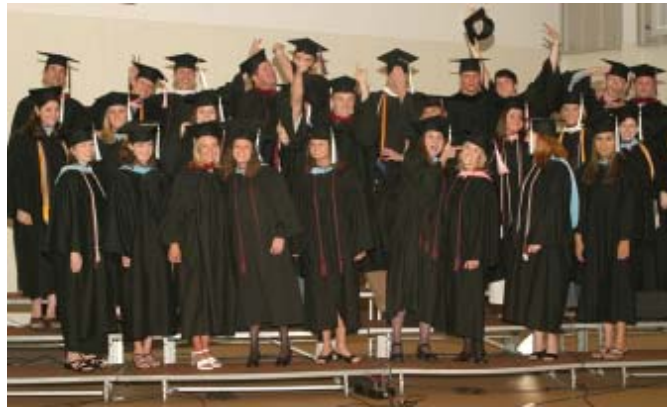
The Real Class of 2005