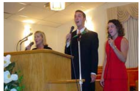
At Good News FWB in Huntington, WV.