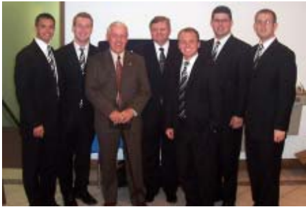
Redeemed with friends at the WV State Mtg.