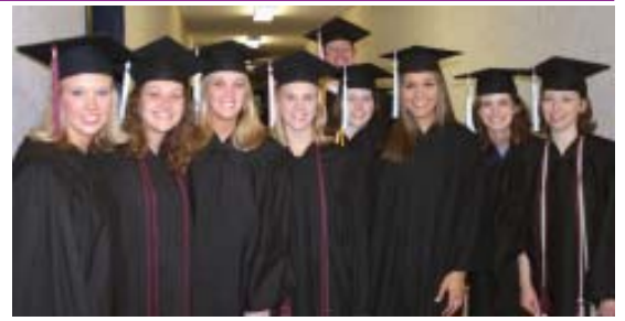
Christian Education Majors—Excited about Graduation

Southeastern held its annual commencement ceremony on May 6, 2005, at 10:00 a.m. in the Activities Center. Twenty-nine students received diplomas, one of the largest graduating classes in the