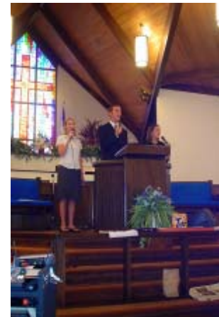
At Central FWB in Huntington, WV.