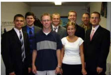
Our groups make friends across the country.