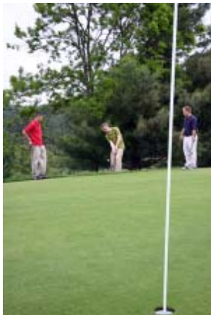
There is some time for recreation.