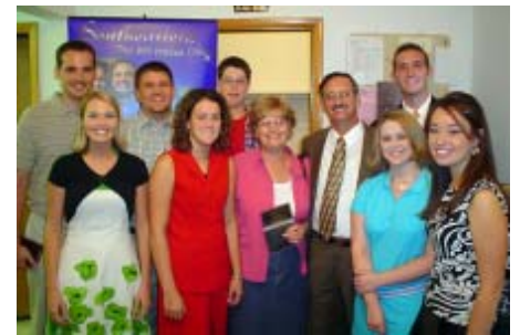
With some good folks from Huntington, WV.