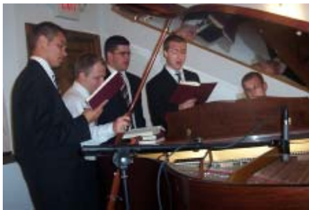
Getting a little practice in on the road.