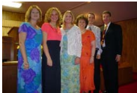
The Gwartneys & Majesty traveled out West.