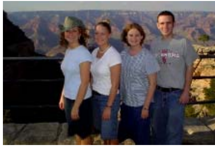
Majesty trio saw some beautiful landscapes.