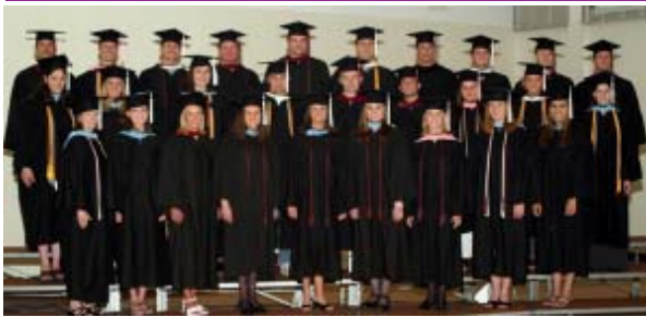
The Class of 2005