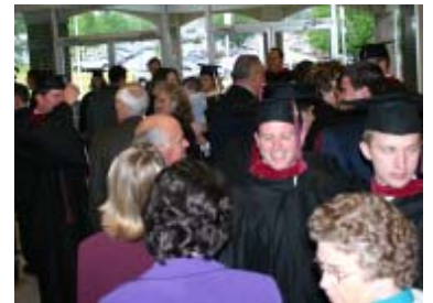
Friends and family came from all over the country to honor our graduates.