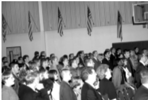
The opening services welcomed 150 students from 18 states.