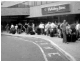
Unloading at the Hotel

On August 18-20, we had the opportunity to take forty of our student leaders to New