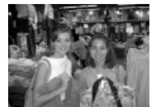
Shopping at Macy's was a favorite with the girls.