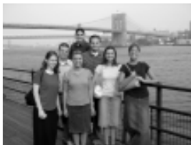
The Winning Team

were able to utilize our travel time on the bus for problem