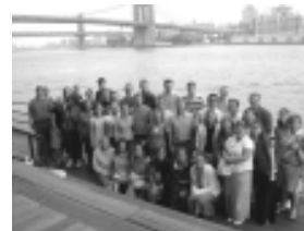
The Whole Group

amazing how God worked in our hearts during this short amount of time. Our student leaders came back with the desire to impact our student body for the glory of Christ—no matter the cost. It is our desire at SFWBC for our students to leave this institution with an attitude of sacrifice and