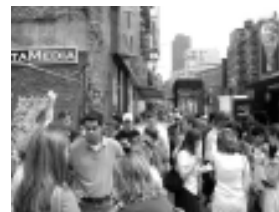
Southeastern Students mingle with the masses near China Town

a solid foundation for Christ-honoring service. The SLC is a vital part of this mission as our student leaders will influence the spiritual direction of