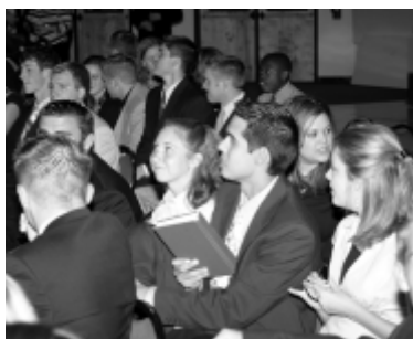
The students were happy to be back on campus.