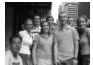
Some of the gang with native New Yorker.

this campus. Please pray for them as they strive to be young people who lead with Spiritual/Biblical Leadership in the 2004-2005 school year.