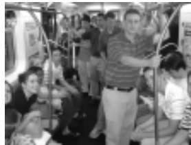
The Student Leaders Packed on the Subway

The underlying theme of the SLC '04 was "Sacrifice is necessary for life-changing leadership to take place." It is