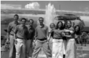
The summer uncovered many memories to be cherished for a lifetime.