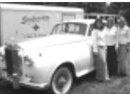
Hap Gwartney's Rolls Royce