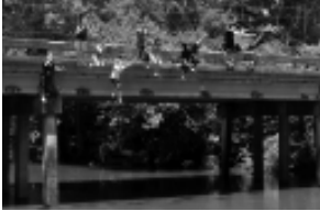
The "Sounds of Praise" jump in harmony.