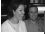
At Cornerstone FWB Church in Tulsa Oklahoma, we saw Southeastern