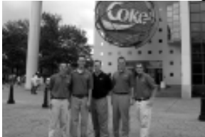
The "Coke Factory" guys.