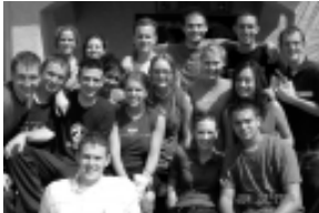
The "Sounds of Praise."