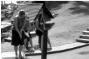
Some of the gang hit the links.