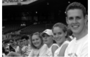
The gang at a Braves game.