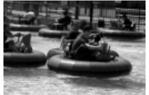
Bumper boat battles.