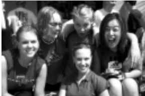
These girls are all wet from the bumper boats.