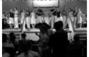
Singing at the "Heart of the South."