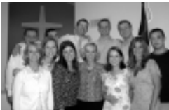
The Past, Present, and Future Southeastern Students from Mesa, AZ